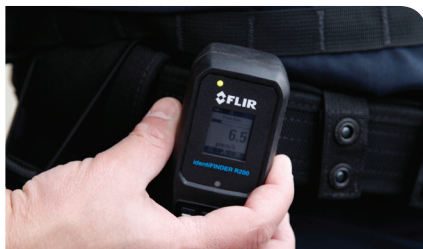
Belt-wearable for easy access