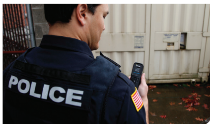
Easy-to-read interface for quick threat detection